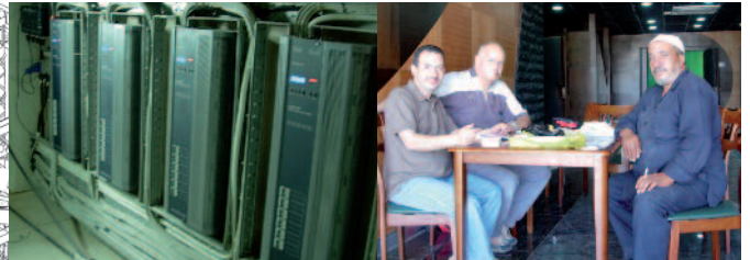
A MOMENT OF PAUSE FOR THE TECHNICAL TEAM

RAIL SYSTEM FIXED ON TRUSSES WITH U-SHAPE CROMAKEY CLOTHES 26X5.5M IN THE LARGE STUDIO AND 16X5.5M IN BOTH THE MEDIUM AND SMALL STUDIOS. ELECTRICAL AND DMX DISTRIBUTION, TRAINING, COMMISSIONING.