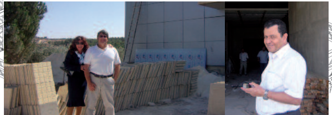
FABRIZIA IANIRO AND ROBERTO NOVELLI SURVEY THE SITE ON CONSTRUCTION